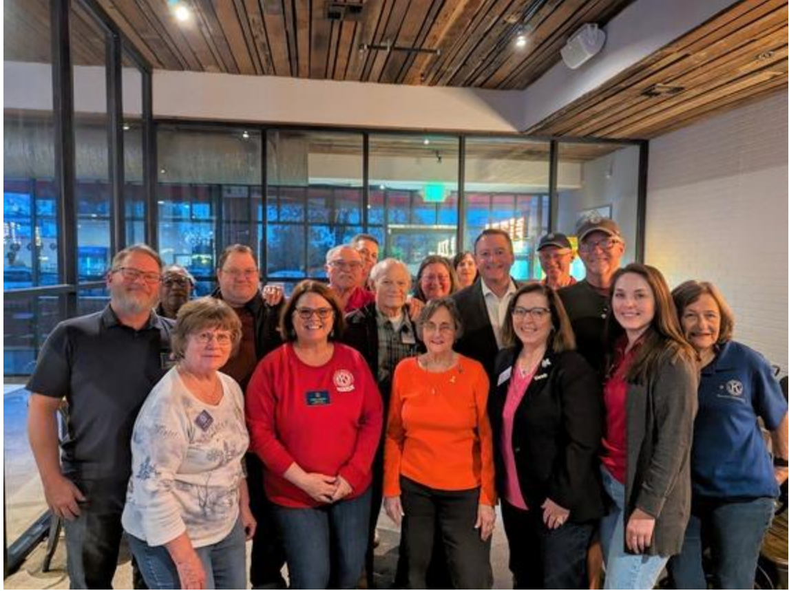
Hanging out with the Rancho Cordova Kiwanis Club at their monthly meeting.