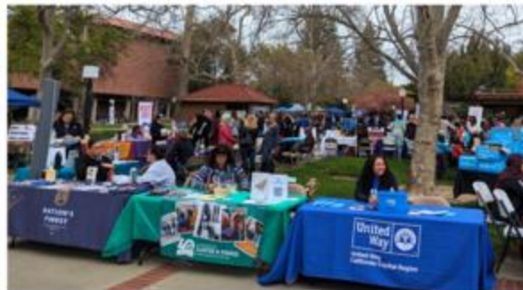
Had a great time at the inaugural Sacramento County Women & Girls Festival in honor of International Women's Day held at Sacramento City College.