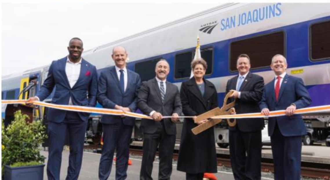
As Chair of the San Joaquin Joint Powers Authority, I was honored to attend the launch of the new, state-of-the-art Siemens Venture Rail Cars at the Stockton Rail Maintenance Facility.